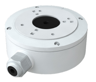
PR-JB12IP66 Small Water-proof Junction Box