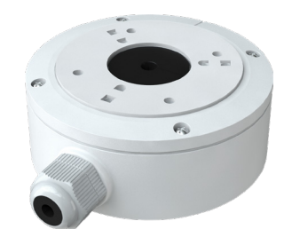
PR-JB12IP66 Small Water-proof Junction Box