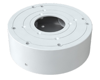
PR-JB12IP64 Small Junction Box